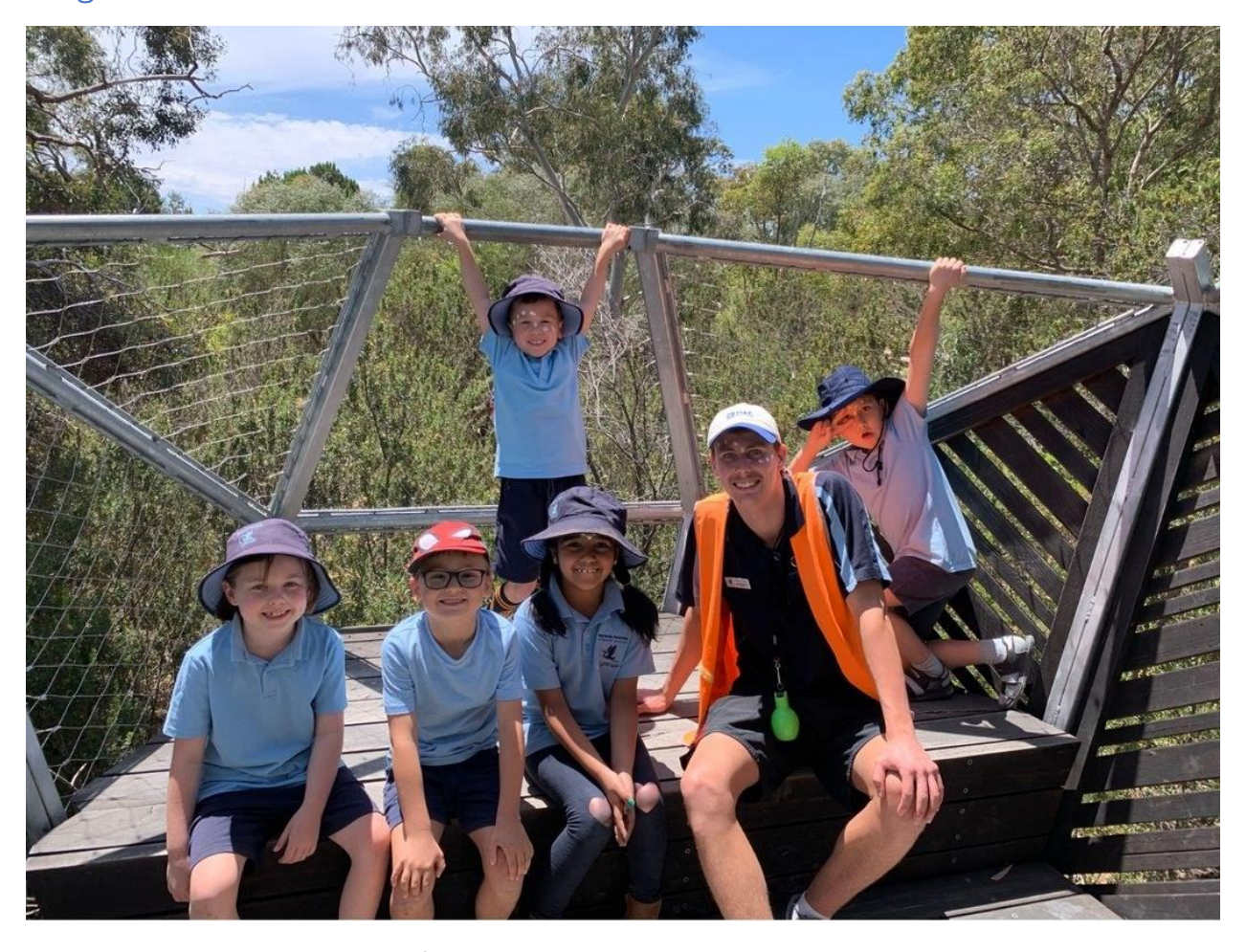
The Year 1 kids went to Kings Park for an excursion where they participated in some exciting adventures.